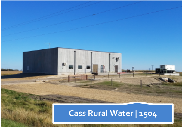
Cass Rural Water | 1504