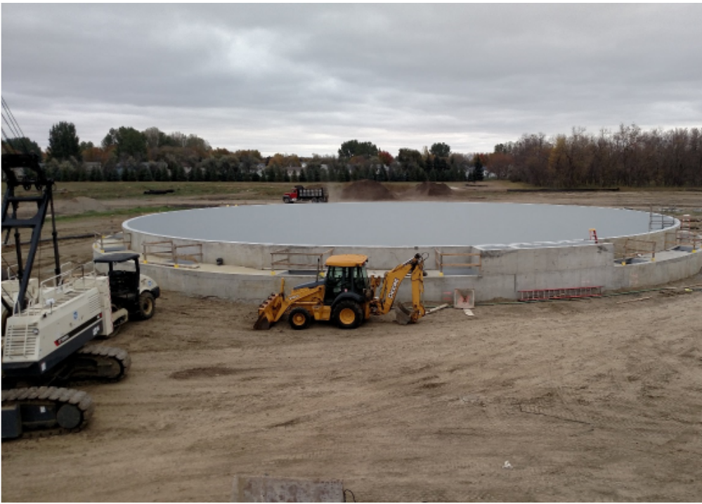
BISMARCK WASTEWATER TREATMENT FACILITY

PKG Contracting, Inc. 4301 South University Dr Fargo, ND 58104 Ph: 701.232.3878 www.pkg-inc.com