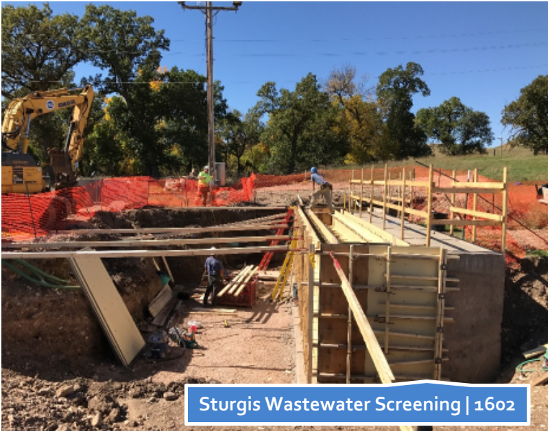
Sturgis Wastewater Screening | 1602