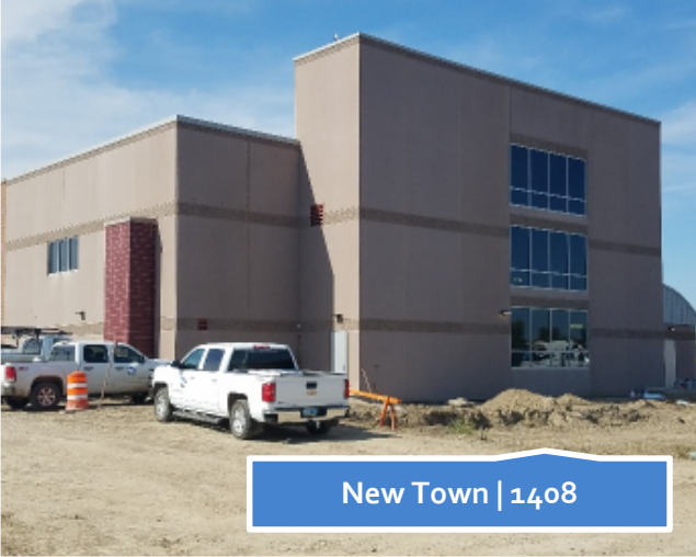
New Town | 1408