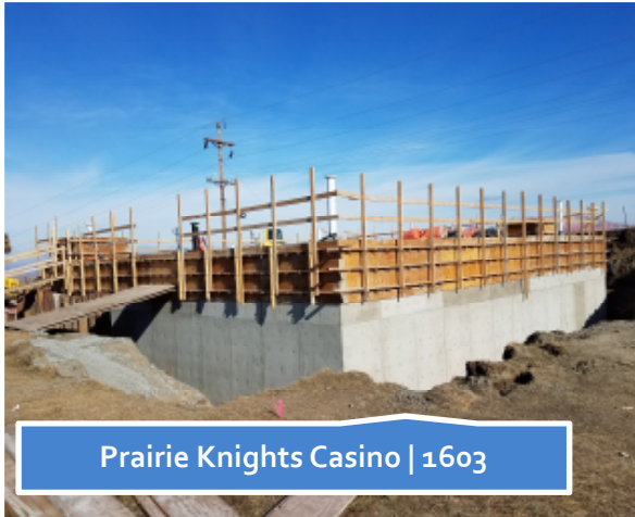
Prairie Knights Casino | 1603