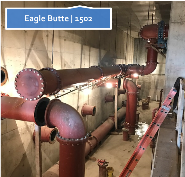
Eagle Butte | 1502