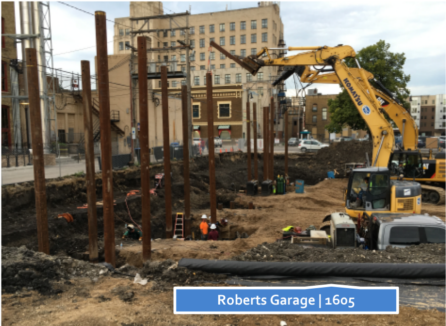
Roberts Garage | 1605